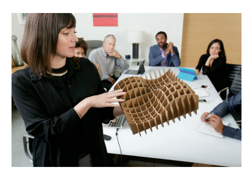
For razor sharp close-ups of objects and whitboard content, the GROUP camera offers 10x lossless zoom enabling your team to see every detail with outstanding resolution and clarity.

GROUP offers the flexibility to customize conference room set-up with multiple camera mounting options. Use the camera on the table or mount it on the wall with included hardware. The bottom of the camera is designed with a standard tripod thread for added versatility. Conference participants can also clearly converse within a 6m/20' diameter around the base, or extend the range to 8.5m/28' with optional expansion mics.